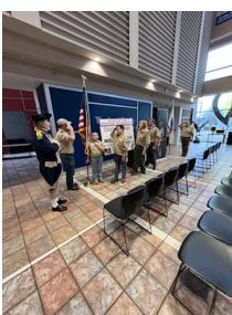
The opening ceremony for the Merit Badge Workshop on March 11th.