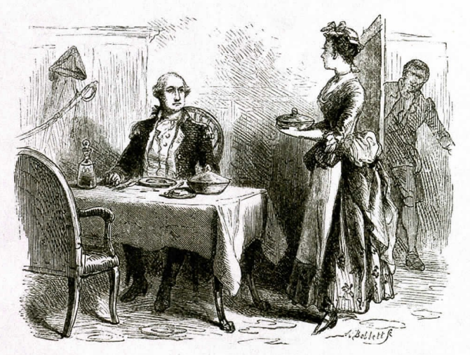
TRAITORS A conspiracy to assassinate Washington reportedly involved feeding him poisoned peas.

And fortunately for all, the American Revolution was won.